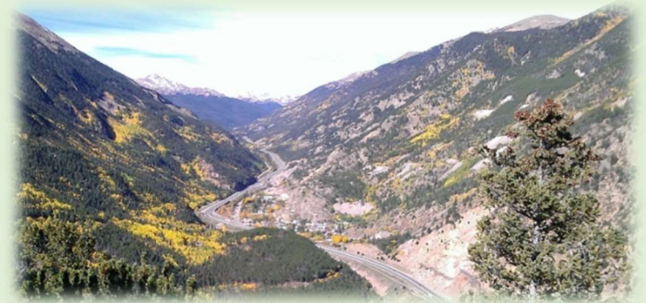
Silver Plume and Upper Clear Creek Valley

Industrial and Engineering Features - Vestiges of early technologies and mining remnants are visible in the landscape. The Georgetown Loop Historic Mining and Railroad Park, in the valley between the two towns, interprets the industrial history with the narrow-gauge train, Lebanon mine, and remains of the Lebanon mill. Innovations in mining expanded in the district with the creation of the famous Burleigh drill and later the use of a Sigafos electric powered tunneling machine that bored an 8-foot-wide circular tunnel into the side of Democrat Mountain. The first long-distance telephone line in Colorado ran from Denver to Georgetown. Water provided the mines and mills in both towns with power. The 1900 Georgetown Hydroelectric Plant on 6 th Street still operates today on the original Pelton Water Wheels.