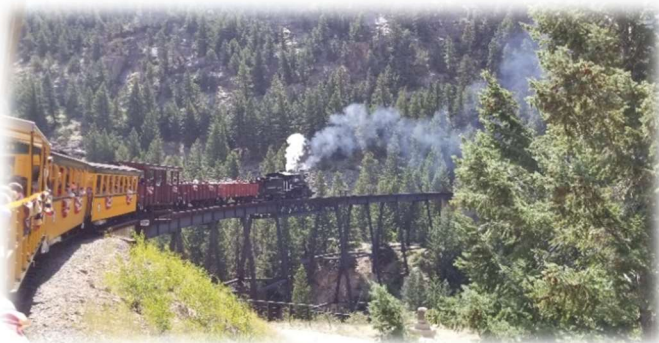
Georgetown Loop Railroad

Historic Preservation – Preservation efforts in both towns continue to protect their architecture, ambience, and setting within 21 st century living communities. Georgetown's 1970 comprehensive historic preservation ordinance established a legal precedent for historic preservation in the State of Colorado that has been emulated by other historic cities and towns statewide.